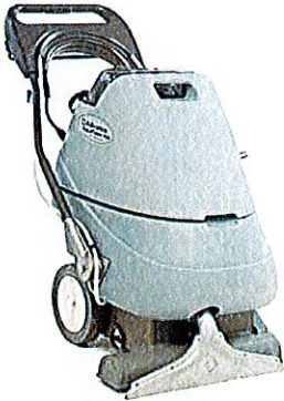
Corded Extractor 21-point inspection