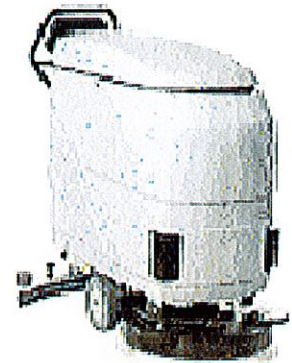
Autoscrubber 31-point inspection