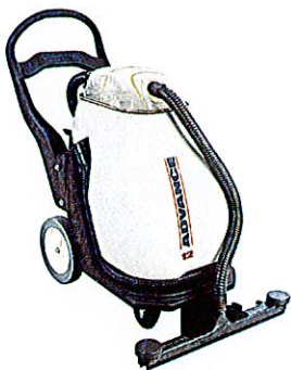
• Wet / Dry Vacuums 14-point inspection