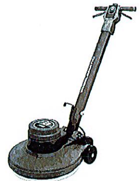
Floor Machines/Burnishers 16-point inspection